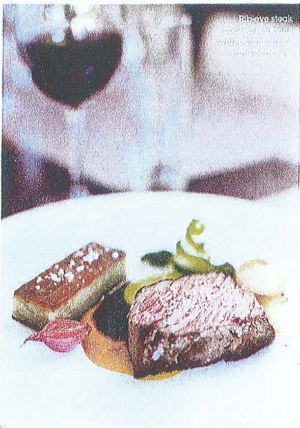
Rib-eye steak with a side of mashed potatoes and a side of vegetables.

Molecular gastronomy chefs are modern alchemists, using specialized equipment and ingredients borrowed from food scientists to change flavorful liquids into gelled spheres, froth solids into ethereal foams, or vaporize intense tastes into steams diners inhale. Such chefs push the boundaries of what food can be—and how to deliver flavors to eager, if often surprised, guests.