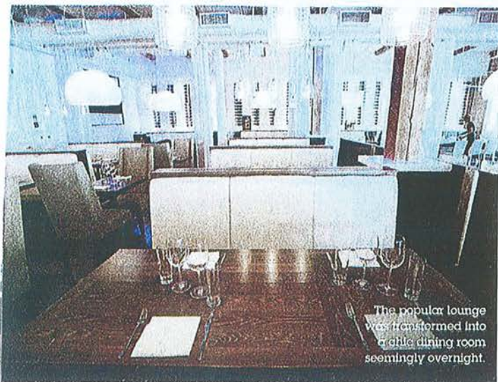
The popular lounge was transformed into a chic dining room seemingly overnight.

menu) to a sleek, light dining room with traditional banquet and table seating. In some ways, the change isn't surprising; Lounge co-owner Ali Mackani has a background in fine dining (his previous restaurant was the very highly regarded 55 Degrees). But in the shift in menu style, the restaurant's metamorphosis was as rapid and complete as the magic performed by such molecular gastronomy pioneers as Ferran Adrià of Spain's celebrated El Bulli or Grant Achatz of Chicago's Alinea, both Michelin three-star restaurants.