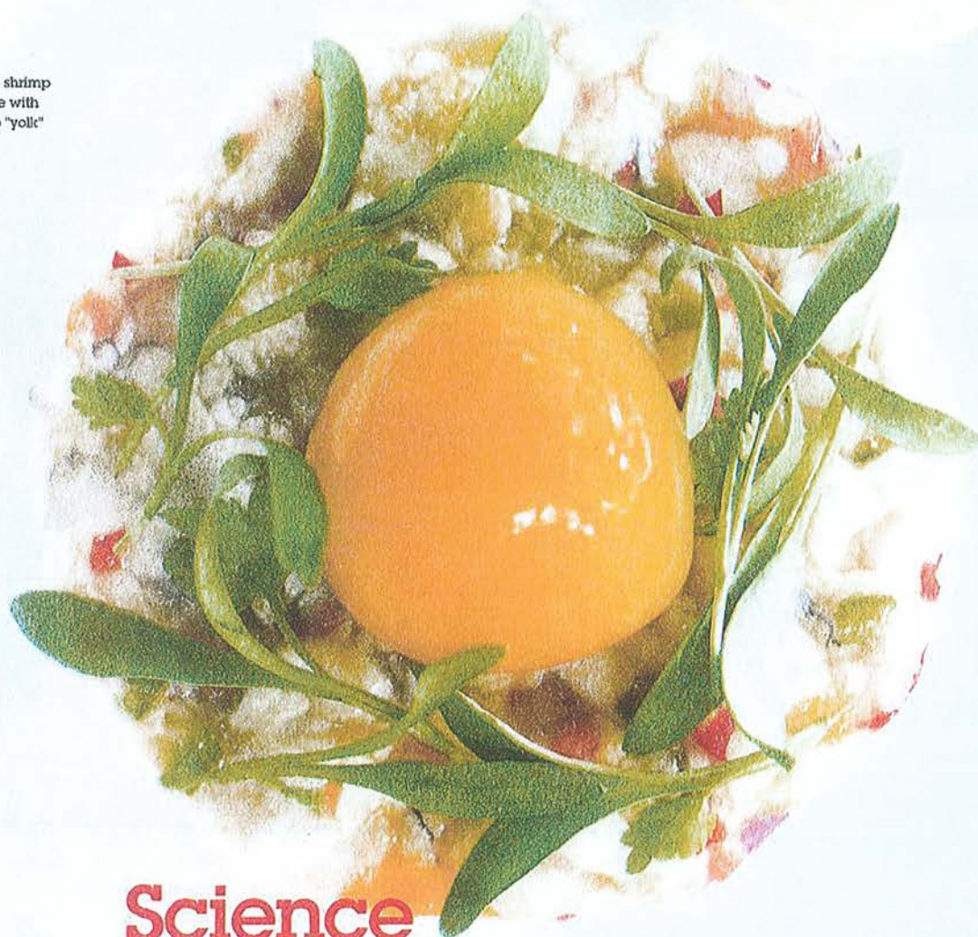
Jumbo shrimp ceviche with mango "yolk"