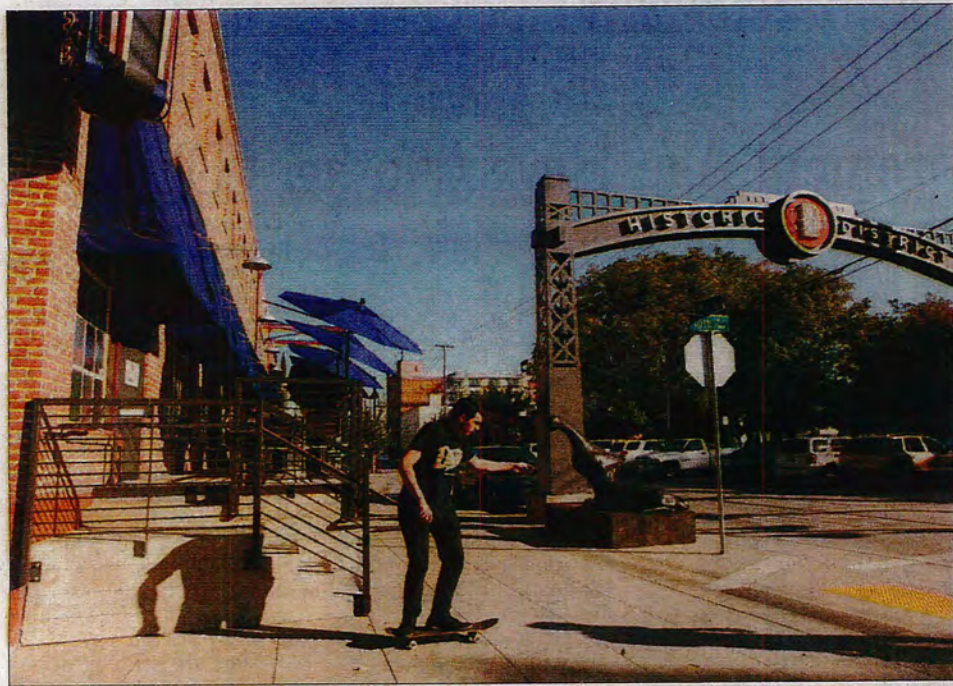
A skateboarder rides by Fox & Goose on the R Street corridor in downtown Sacramento last month. The city has been working for decades to make the area a bustling work-live-play district.